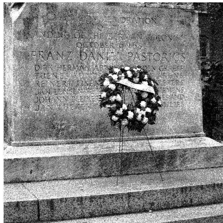
A wreath-laying ceremony was held at the Pastorius Monument in Vernon Park in Germantown in Philadelphia, with the wreath presented by the Steuben Society of America, Pastorius Unit No. 38