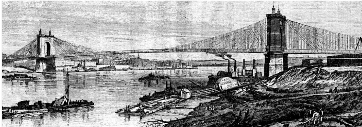
(Our region's majestic John A. Roebling suspension bridge.)

The Appendices contain a list of Roebling's bridges, a timeline of the Roebling Company, and a plethora of illustrations. At 196 pages in length, this edition is more than twice the length of the original.