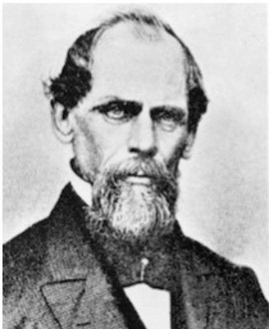
John A. Roebling, chief engineer of the Covington and Cincinnati Suspension Bridge.